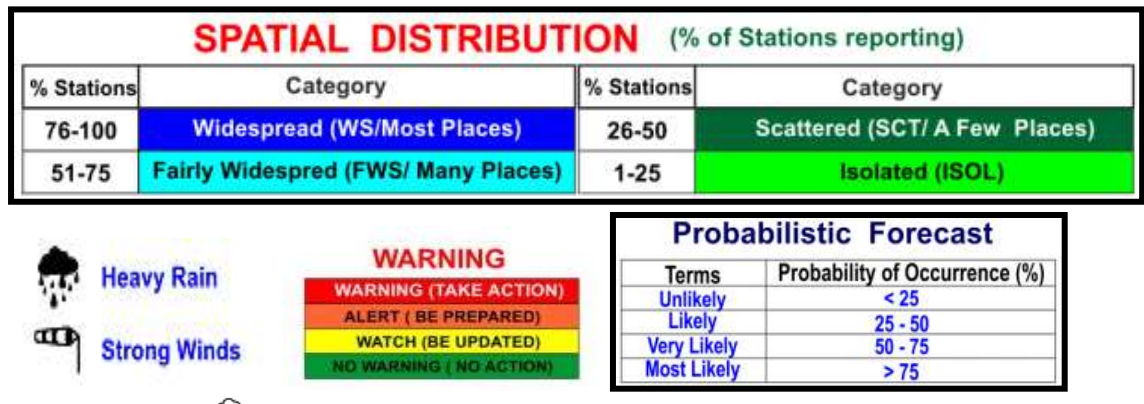
F Thunderstorm with Lightning

6) South India: Coastal Andhra Pradesh & Yanam, Telangana, Rayalaseema, Coastal Karnataka, North Interior Karnataka, South Interior Karnataka, Kerala & Mahe, Tamil Nadu, Puducherry & Karaikal and Lakshadweep.